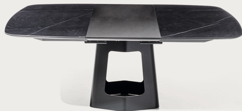
Ivo A QC